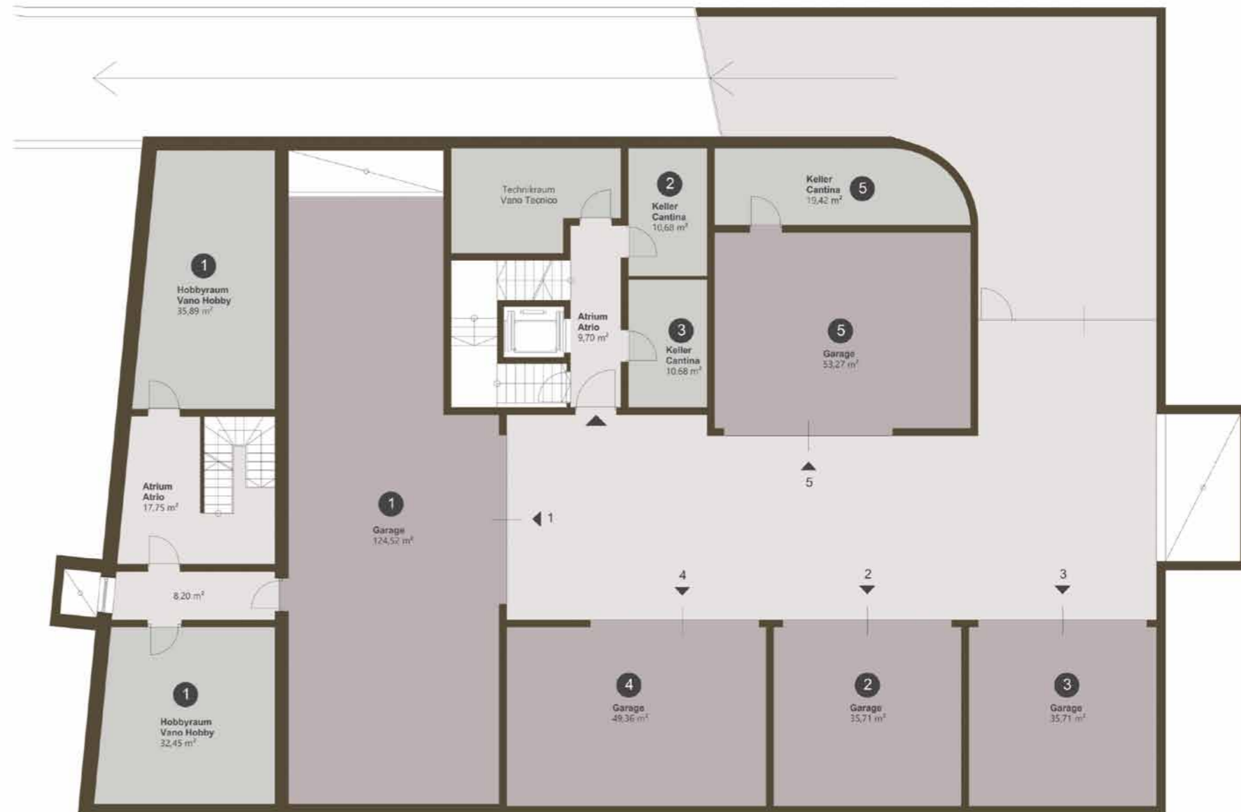
GRUNDRISS / PLANIMETRIA

Garage - Garage 53,2 m 2 Keller - Cantina 19,4 m 2